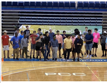
Our 8 guys in the front center ready to compete